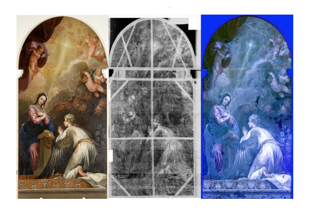
Figure 4. "The Encarnación" by Alonso Cano. Left: Photograph with visible light of "The Encarnación" Centre: X-ray radiography of painting Right: Photograph with Ultraviolet light.

Before restoration activities, it's necessary to document the conservation state of the original works by testing and using the means that science has put into the service of art. The studies with radiation ultraviolet, infrared, and X-ray techniques, are resources available in the workshops to Restoration (figure 4). In addition the technical images can serve students learning from Fine Arts, Restoration o Chemistry.