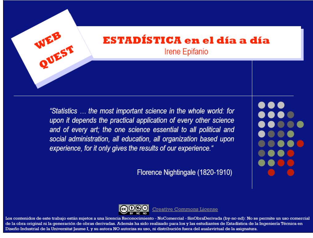
Fig. 1. The first page of the webquest.

In the introduction, I indicate that the basics concepts of the subject will be considered. They should be very clear, for the rest of the course topics. They will also discover how Statistics can help (even the most basic) in close and daily problems of real life and in Industrial Design (Ergonomics, Industrial Design Methodologies, Emotional Design, etc.). Furthermore, we need a basic knowledge of statistics to be a critical citizen and to be able to participate effectively in public argument based on figures and data, inherent to democracy.