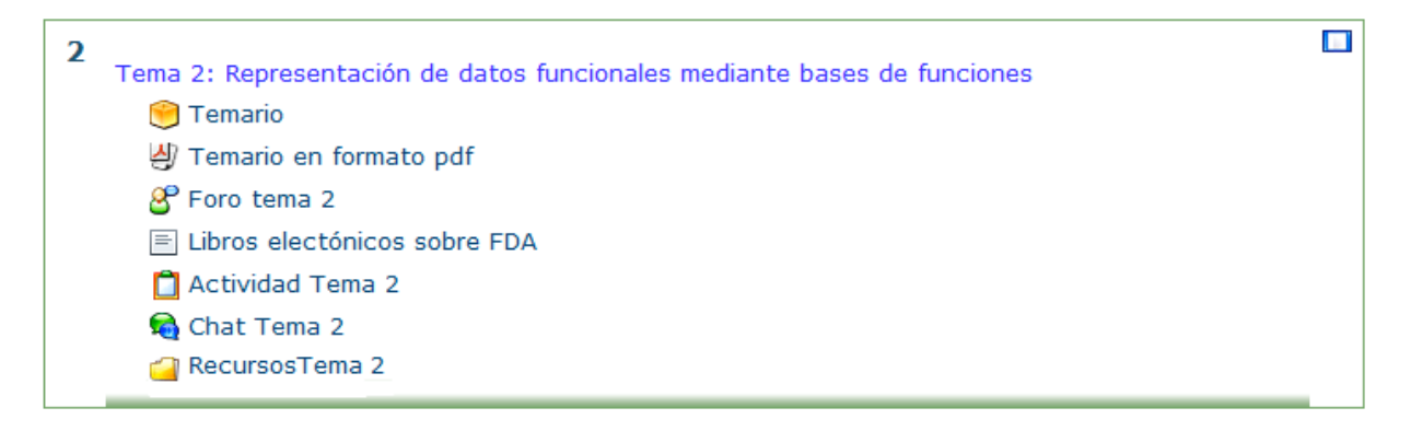
Figure 2: Resources of topic 2 of "Análisis de Datos Funcionales" virtual course.

To promote knowledge sharing among professors and students the Moodle platform [2] offers also essential communication tools as a notice board for up-to-date course information, and forum, chat and e-mail to display and solve the different doubts. With intent of encouraging discussion between all participants, some interesting questions are raised by professor. An example of those tools is provided in the Figure 2.